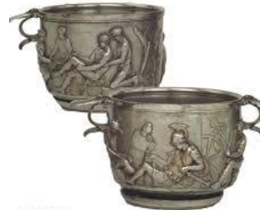
The Hoby cups THE NATIONAL MUSEUM OF DENMARK